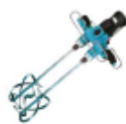
Double Mixing Paddle Medium quantities