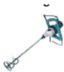
Drill and Mixing Paddle Small quantities