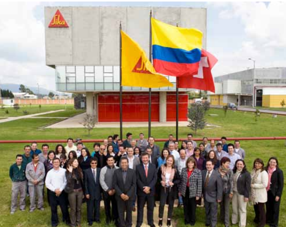
Proud employees of Sika Colombia

In order to complete the value chain, the waste is also recycled for compost production to generate humus, which is used for gardens and by tree nurseries in the neighborhoods. There is only one waste material from industrial water that is disposed of as debris. Environmental care and sustainability of industrial activity diminishes the impact on natural resources, is cost effective and improves environmental responsibility. The target of the second phase of this water program is to have zero waste. Sika is now sending a request to the local environmental authorities for a license for further development.