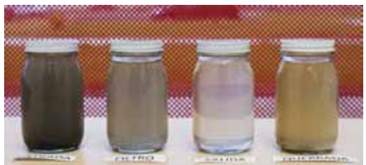
The third glass shows the final result of the purification process.

biological and chemical processes, it is recovered in compliance with environmental guidelines so it can be discharged back into a river.