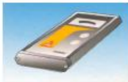
Measuring of the substrate moisture: Moisture content < 4% by weight. E.g. Sika Tramex moisture meter.

Prior to application, confirm substrate moisture content, r.h. and dew point. If > 4% pbw moisture content, Sikafloor ® EpoCem ® may be applied as a T.M.B. (temporary moisture barrier) system.