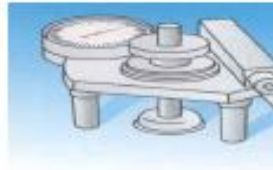
Testing of the substrate Pull-off strength > 1.5 N/mm 2 . E.g. Proceq, Dyna pull-off tester.