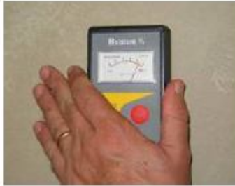
Tramex moisture meter.

There must be no rising moisture according to ASTM D 4263 (Polyethylene sheet test)