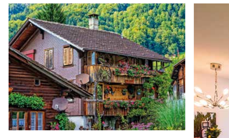
Daring yet sublime: These three shots show how a modern, colorful flooring solution combines with a traditional – and highly recognizable – exterior to create a modern interior in Brienz, Switzerland; that's Sikafloor® PS 23 System.

ANDREAS BOMMER House owner, Brienz, Switzerland