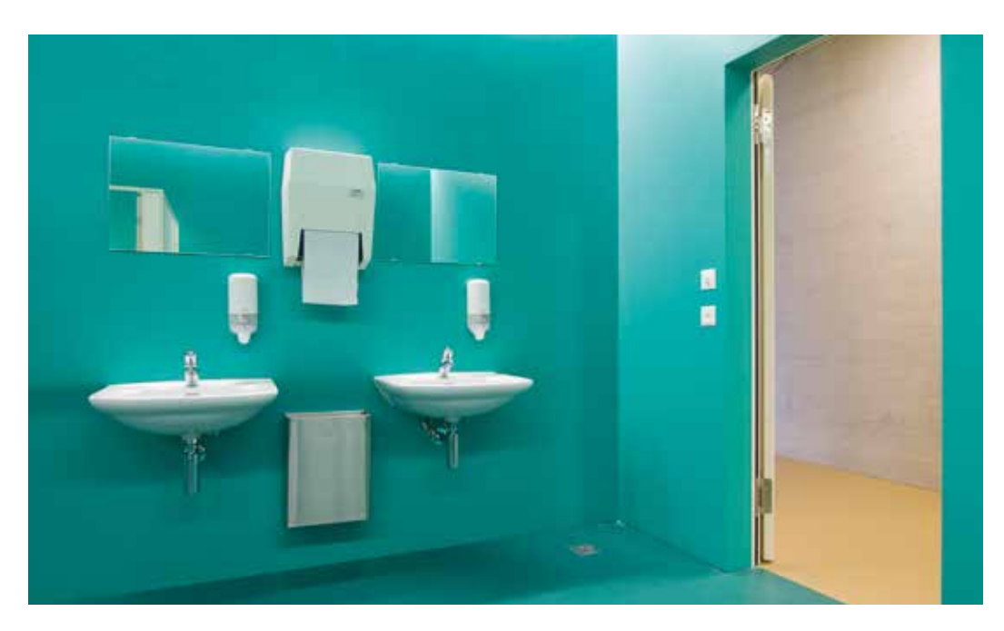
Top: Tough enough for school, in Weggis, Switzerland. Bottom: Locker room floor is completely moistureresistant and looks good; Morschwil, Switzerland.