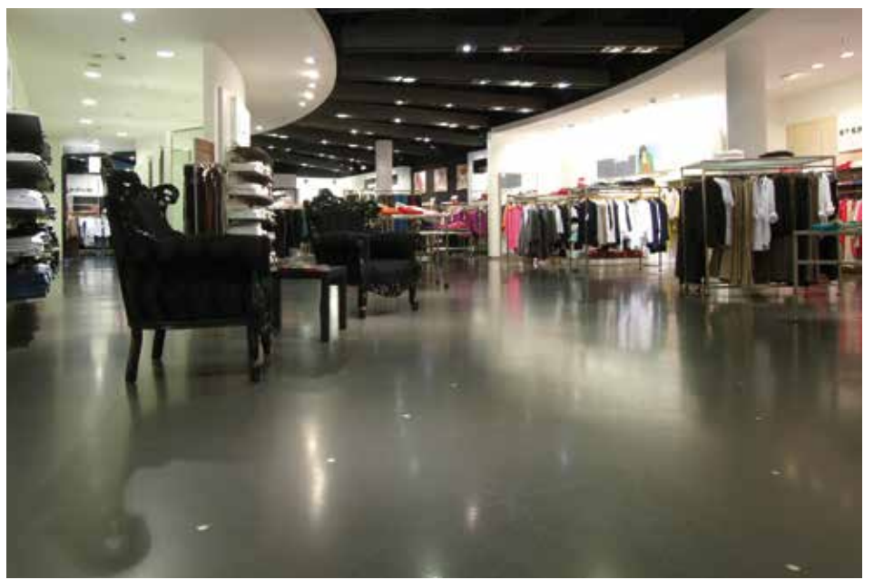
Top: Pharmacy in Schoeftland, Switzerland counts on the durability of Sika ComfortFloor®. Bottom left : Proven success in retail areas; here in a coffee shop in Waterloo, Belgium. Bottom right : Heavy customer traffic is no problem in the Krause store at the Sihlcity mall in Zurich, Switzerland.