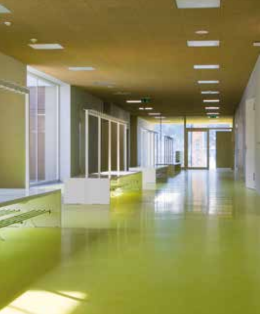
Top left: A learning & development center in Hasselt, Belgium needed a floor to complement the contemporary architectural style. Top: A hard-wearing and easy-to-maintain floor for a middle school in Namur, Belgium. Bottom: The hallway of the school in Weggis in Switzerland opted for a floor with superior acoustics.