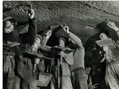
Hudson Tunnel of the Pennsylvania Railroad in New York.

By 1970's Sika introduced 1 st complete Repair and protection system with Sika reinforced primer, repair mortar, leveling mortar and protective impregnations coatings